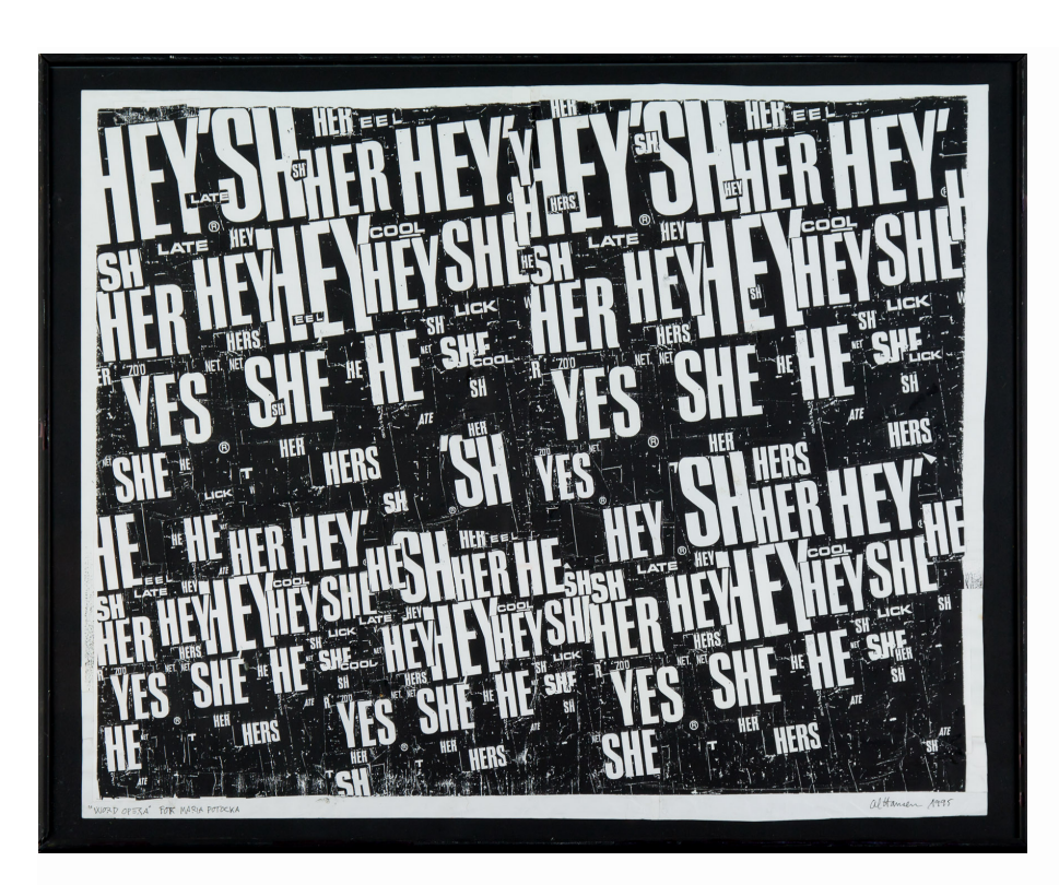
Al Hansen, Word Opera, 1995, collage, 37,5 × 46 cm, MOCAK Collection