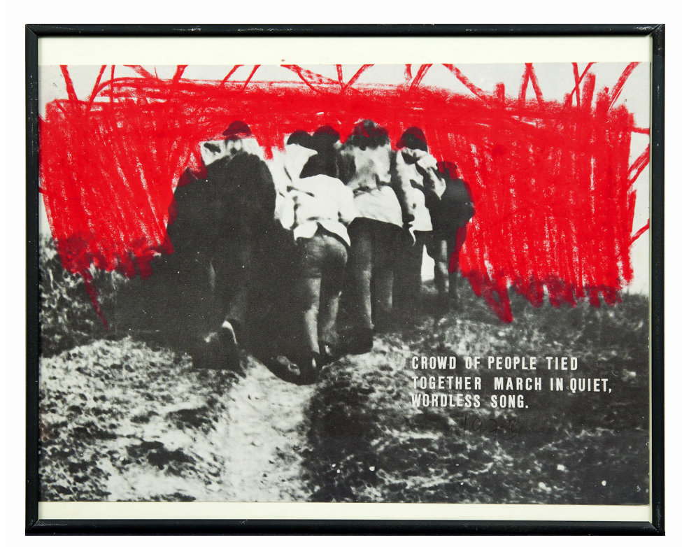
Milan Knížák, Abf\"{a}lle , 1973, serigraph, wax crayon, self-adhesive letters / paper, 21 x 29,5 cm, MOCAK Collection